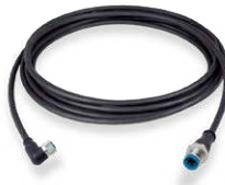
CABLES AND ACCESSORIES