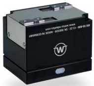
GRIPPER MODULE AS ORDERED